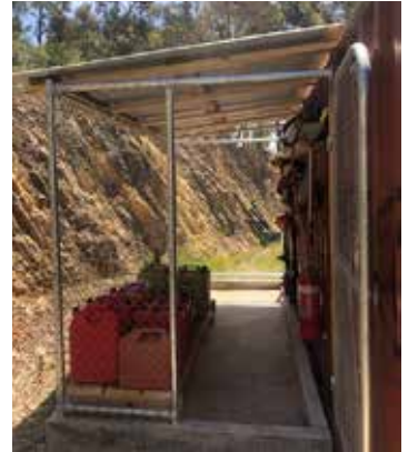
Completed fuel cage in November