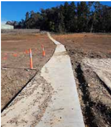
Pathway to D marina completed in July