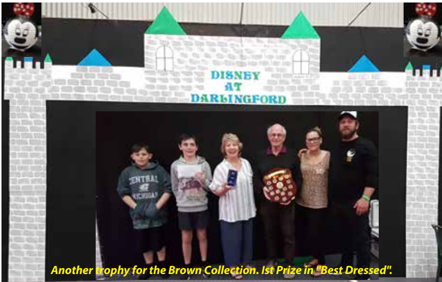
Another trophy for the Brown Collection. 1st Prize in "Best Dressed".