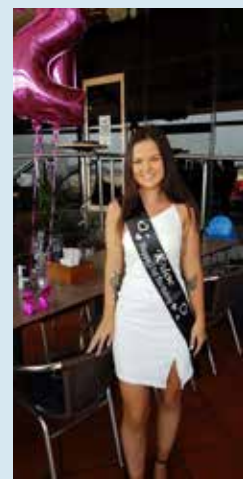
That's the end of birthdays so now for other bits...

If we didn't see it, we wouldn't have believed it, but there was snow on Mt Torbrek on 9th November. (I just want to record that for historical evidence!)