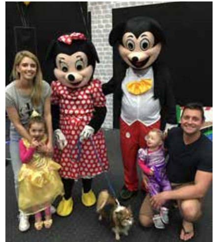
Just like being in Disneyland