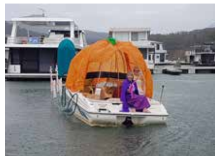
Above: more profiles of our winning boat - great effort, thanks for parading in the rain!