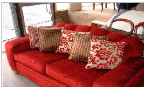
Repaired and Recovered