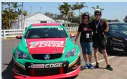
So this was one way of embracing 60. A surprise gift of driving 7 laps in a race car then 2 hot laps with one hot racing car driver!! On the Gold Coast in the Sunshine!