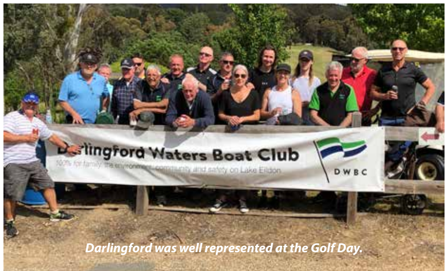
Darlingford was well represented at the Golf Day.

(Eildon Community Charity Golf Day Committee 2019)