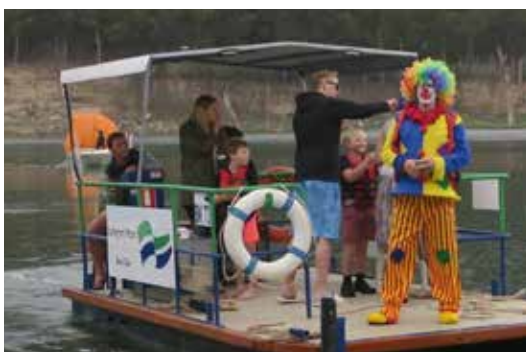
Team Ford taking our resident clown on his annual outing armed with lollies for the faithful.