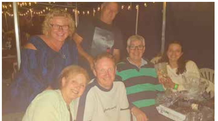
The new crew from K-Sera