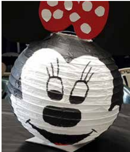
Table decs by Kirsty. Awesome!