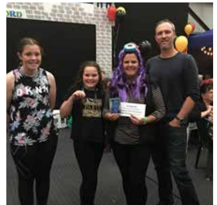
Chit Chat with their 3rd prize for Best Dressed Group - Monsters Inc.