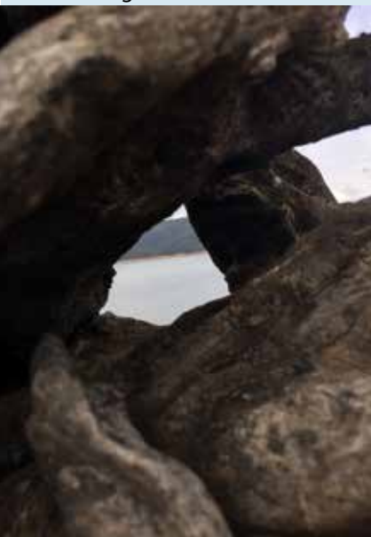
Below is another photo taken by Emma Bavage. Great Work Emma!