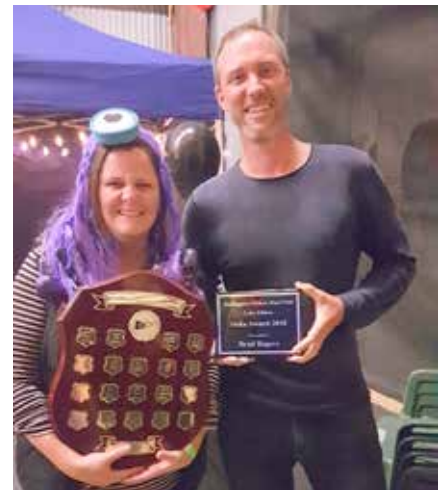
Keeping the DELIA in the family - Congrats!