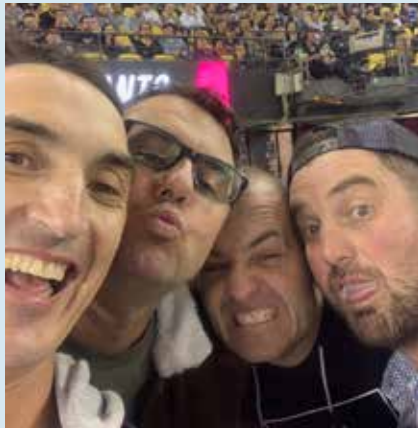
The Boys-on-B had VIP seats at Marvel Stadium for the recent supercross/ motocross AUS-X Open which is a pretty big deal apparently. Heard they did not see one bike!