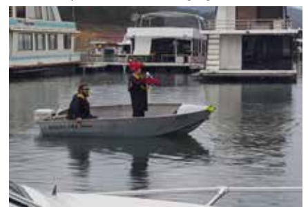
Just follow that carriage.