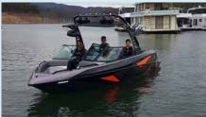
New boat take two!

Brownny has a new boat finally. Hope this one floats a bit longer than the last one. Keep an eye out that window Brownny!