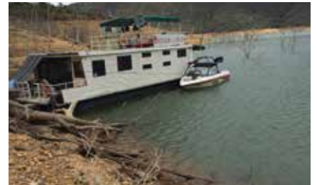
Dragon Lady II in 2015

Newly appointed, I want to aid and assist the club moving forward where I can in 2020.