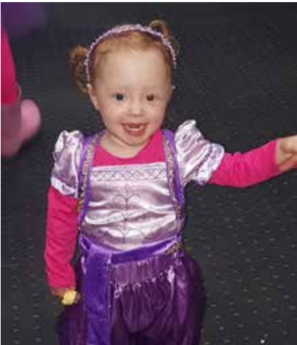
Princess Skye is happy to look now.