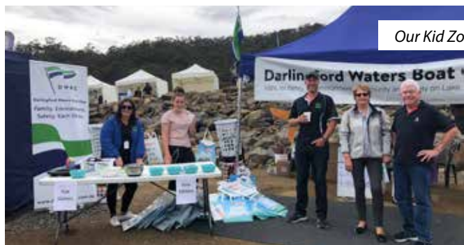
Our Kid Zone at the Wall