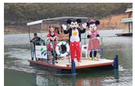
Mickey & Minnie & co...singing in the rain!