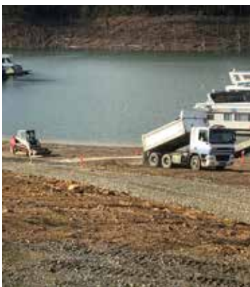
Ground works being carried out in August

Summer is here but you wouldn't know it! The lake is at 45.12 % (as we go to print) and dropping slowly but hopefully we will get a bit of rain before the holidays start.