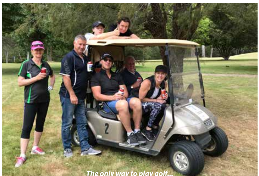
The only way to play golf...