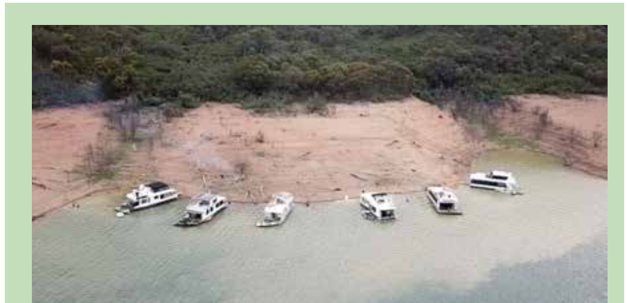
This is a great drone photo of the Boys-on-B taken over Sail Past weekend but there is an even greater story behind it.....you need to ask Barney!