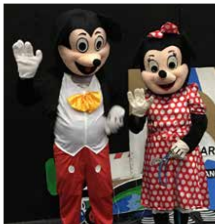
Mickey & Minnie just working the crowd