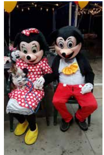
Minnie & Mickey from Odyssey