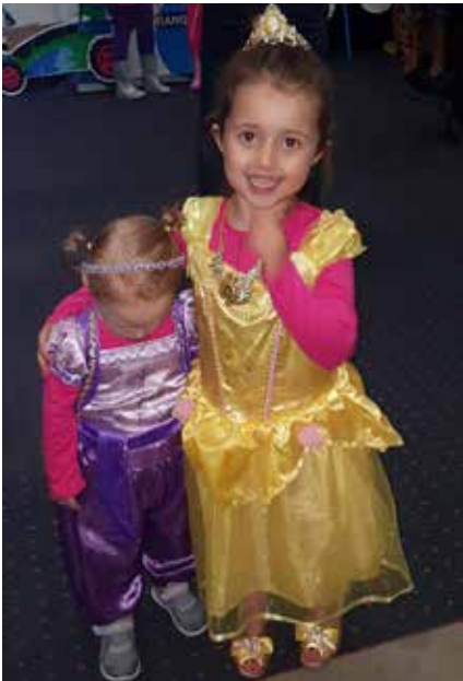
Winning Princess - Skye & Eve