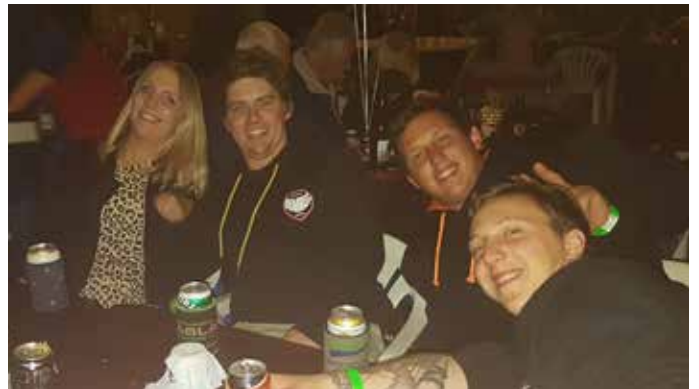
Some of the Ford crew from Taurus II