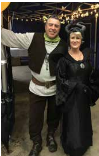
Shrek & Maleficent