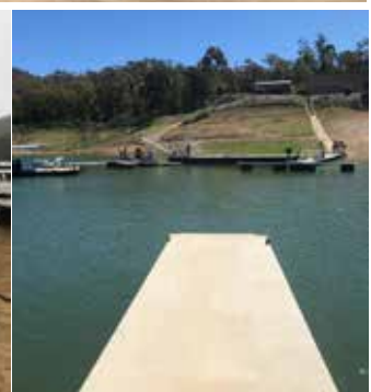
From factory to the water. The new marina sections being fabricated, transported, assembled on site, craned to the lake, and placed into B&D marinas. All in a days work.....