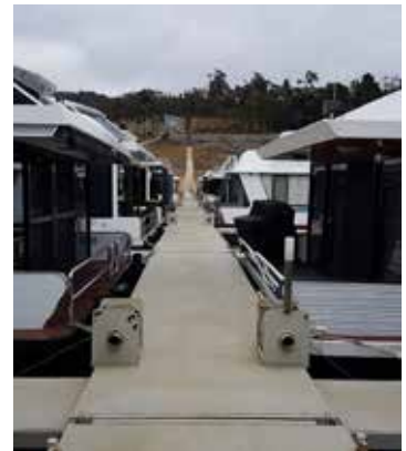
C marina and pathway complete