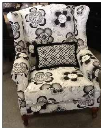
New - Made to Order