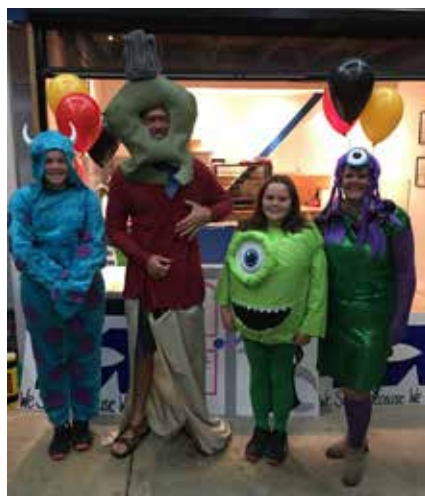
Monsters Inc....great costume work!