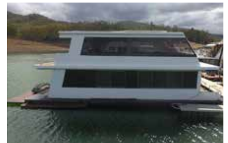
Looking a little bit different in 2019